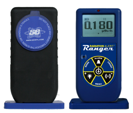
Lanyard, Ruggedized Boot, Detector Cover, USB Cable and Stand Included